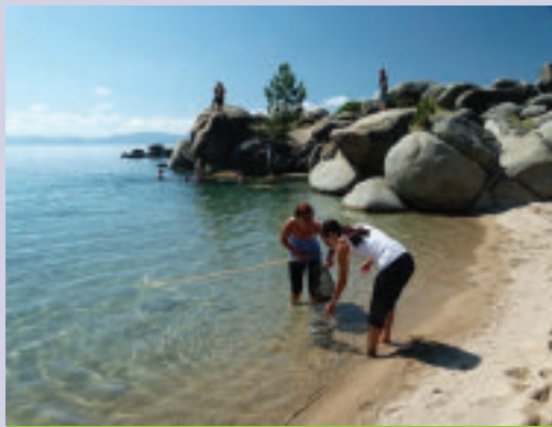
WATERWORKS Students collect crawdads in Lake Tahoe, part of an undergraduate sustainability program.

Sustainability is a core value of the strategic plan at Lane Community College ( lanecc.edu/sustainability ) in Eugene, Ore. The college's Institute for Sustainable Practices administers two-year degrees in fields like energy management and water conservation technology. And the college has ambitious campus sustainability initiatives, including LEED gold or platinum certification for new buildings, low-water landscaping certified as wildlife habitat by the National Wildlife Federation, and a program that gives prizes to campus administrative and academic offices that meet waste-reduction and energy-saving goals. Lane Community College also has a student-run Learning