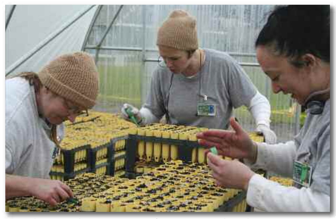
Inmate technicians at Washington Corrections Center for Women sow native plant seeds.

the opportunities at Cedar Creek, leading to the development of more studies and more sustainable projects, designed, initiated and managed by Cedar Creek prison staff and offenders.