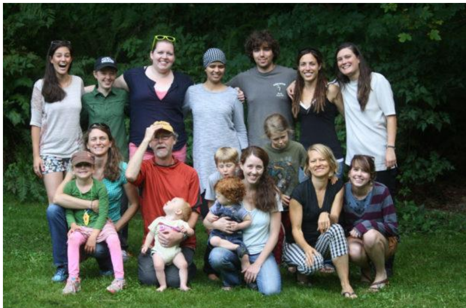
SPP-Evergreen graduation party, 2014.

Graduation brings an end to student-staff employment. Each coordinator trains their successor, which is as much about introducing them to the culture and ways of thinking as it is about program policy and protocols. Each turnover is bittersweet. We have to say good-bye to someone we have relied on and invested in, and it is painful to see them go. At the same time, we get to welcome someone new, and their fresh perspectives help SPP to continually improve; we can't get stale! Also, there is the satisfaction of seeing SPP alumni go on to new and valuable endeavors, and we take pride in supporting their ongoing careers and aspirations.