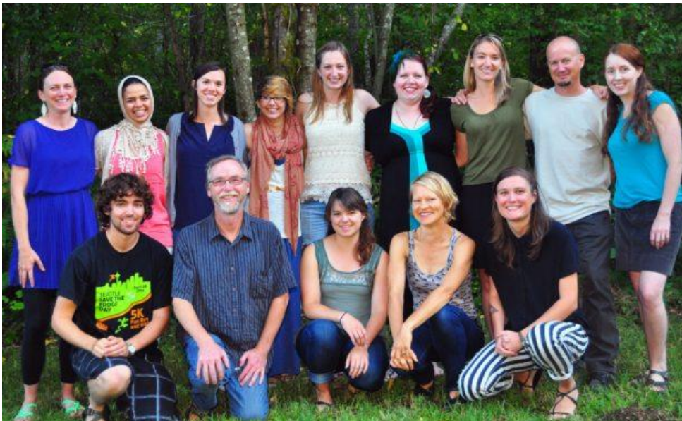
SPP-Evergreen graduation party, 2013.

are part of the program's successes. They continually add to the educational breadth of each program in many forms: formal presentations, seminars on scientific papers, hosting a partner-scientist's visit, recommending readings, and countless conversations about programs' plans, impacts, and larger context. Students also study SPP programs; they help track and evaluate the quality of each program, and ten have conducted formal research on SPP topics (a few