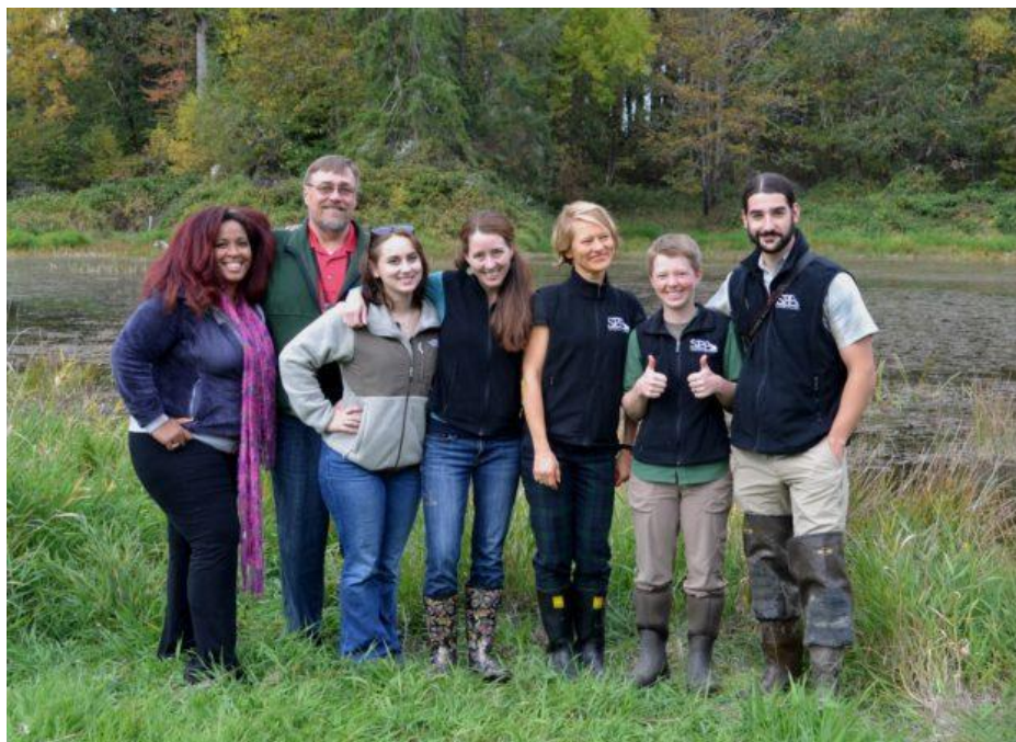
DOC staff, Evergreen staff, and student-staff pose following a successful frog release, October, 2015.

Choosing just a few students to highlight in this newsletter means not highlighting most, and that is hard to do. Thirty-eight Evergreen students have worked for SPP so far. All have brought something important and enduring to our programs. You may learn more about most of them on our staff page . We hope that the following articles will serve to illustrate the range and diversity of their character, expertise, and strengths. These are wonderful humans, and it is such a pleasure to celebrate them!