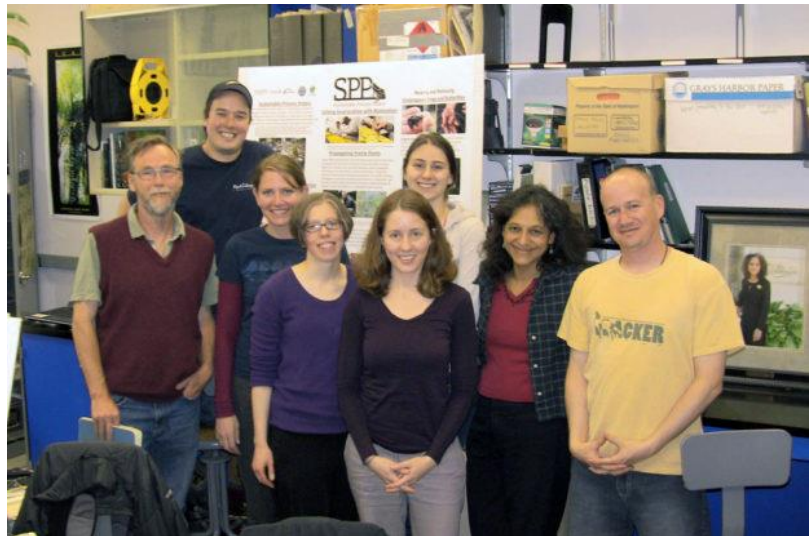
SPP-Evergreen team, 2011.

SPP's founding director at The Evergreen State College hired graduate students to support prison programs beginning in 2008; that was when SPP was gaining traction as a more formal effort, and was growing in scale and scope (more about history here ). At first, the workload demanded just one or two students at a time, and those individuals worked broadly—for multiple programs—to build partnerships and disseminate results. Over time, the number and complexity of programs being coordinated by SPP-Evergreen increased resulting in the current model: a student coordinating each ecological conservation and environmental education program.