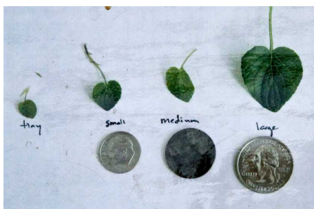
The tiny blue violet leaf is the size inmates at Coffee Creek Correctional Facility harvest for caterpillars at the Oregon Zoo.

“I feel like I have a purpose,” she said. “You’re raising an endangered animal. It’s rewarding.”