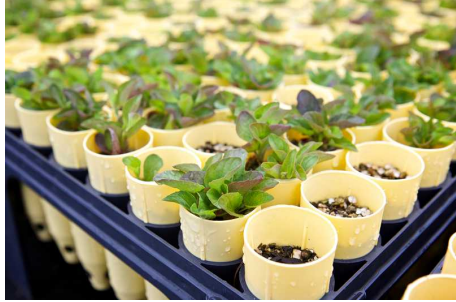
Blue violets sit on pallets to be delivered to Big Creek from the Coffee Creek Correctional Facility.

“This is a project I’m extremely proud of,” he said.